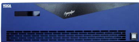
SPYDER™ 200 / 300 SERIES

Each Spyder model conforms to the following specifications: