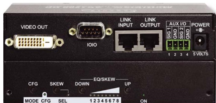
MULTIVIEW DVI RECEIVER FRONT/BACK VIEW (-SAP VERSION)