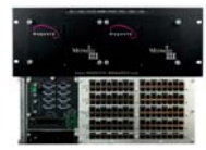
Mondo Matrix Cat5 Switch 16x16 - 256x512