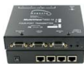
MultiView T4A Transmitter