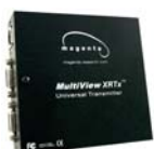
MultiView XRTx Transmitter