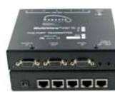
MultiView T5A Transmitter