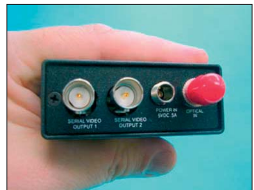
Small, Compact with Re-clocked, Loop-Through Input and Dual Re-clocked Outputs